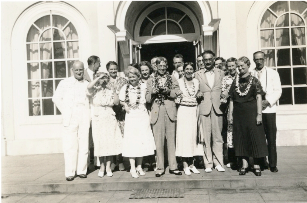
Fig. 2. Delegates at the 1936 Hawaii seminar-conference.

was no agreement as to “what this benevolent ideal implies.” 81 Indeed, he identifies a persistent division in the discussions, one that even the most careful syllabus planning and pedagogic guidance could not alleviate. Keesing described a yawning gap between those who took an expansive and idealist view of education, whereby an effective program of education was “to formulate a comprehensive philosophy of life,” and those who adopted a more practical or pragmatic view of education as a “process ‘fostering intelligent adaptation’ to life’s problems as they are.” 82 The latter opinion was more in line with Keesing’s own view.